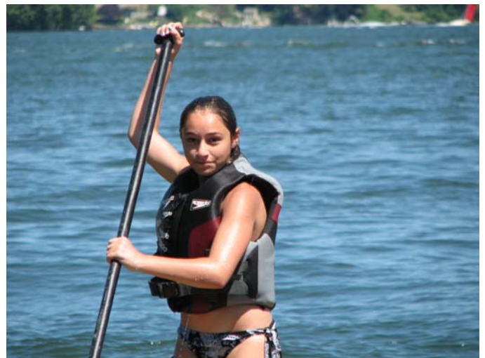
Why sail when one can paddle upright?