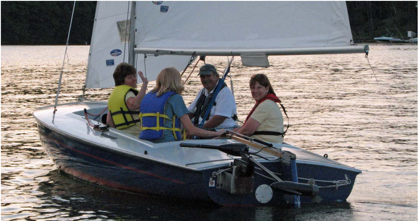
The Roger Punzi sailing school?