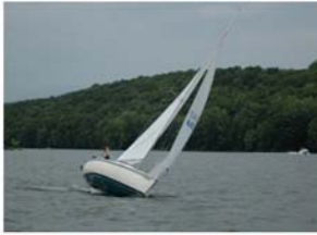
Maggie Bozzuti has all under control as Tom Mullen remains apparently camera shy!

The VC Cup can no longer be called the "Windless Race"! The winds grew stronger with each successive race. By the last of three races everyone completed the course with their day's personal best time!