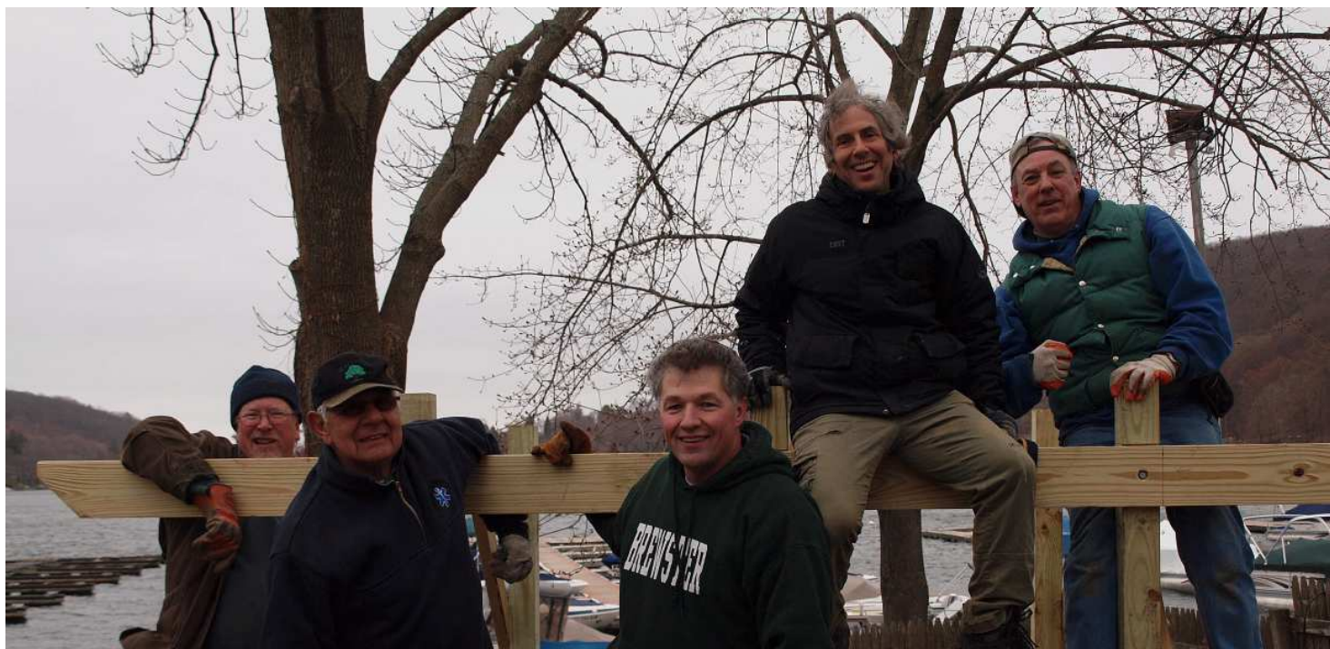
April 2011- They were cold but happy- photo Greg Northrop