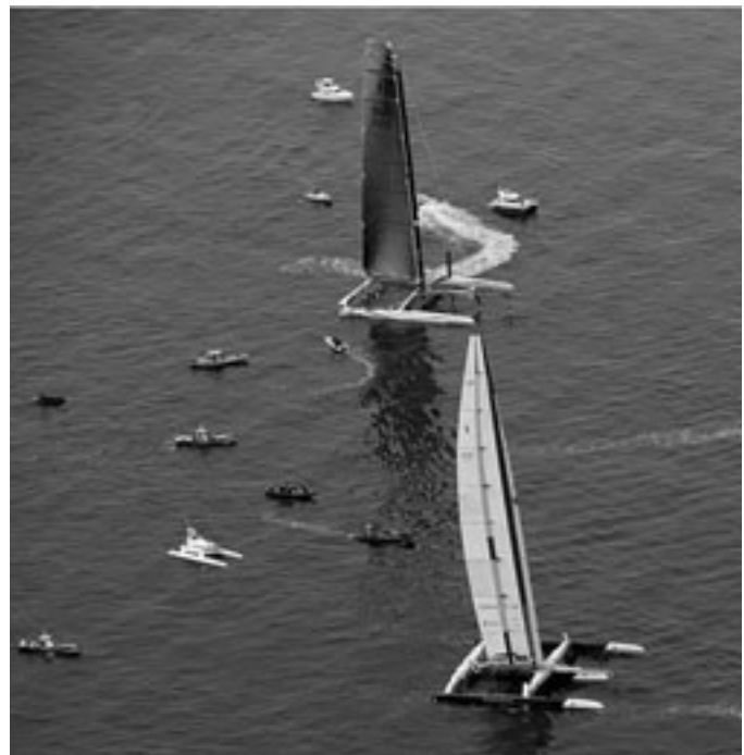
Americas Cup Race